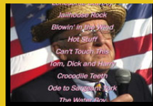
Larry Craig Sings!

Liberty News TV is a production of the Liberty News Group, a grassroots-funded progressive organization in Portland, Maine. Send tax deductible donations to: