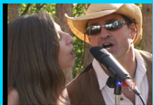
Man of Nature